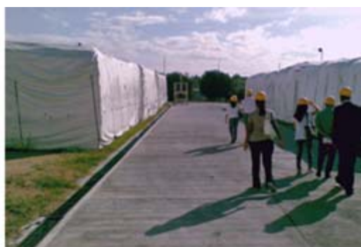
Figure 1. Outdoor storage in cocoons TM , Philippines, 2008.

A newer type of Cocoon called the MegaCocoon TM has more recently been introduced for larger scale storage of up to 1050 tonnes, with initial installations in Sudan (Fig. 2). For smaller unit containers of 60 kg to 90 kg capacity, a 150 g weighing highly transportable SuperGrainbag TM (SGB) is used (Fig. 3). The SGB