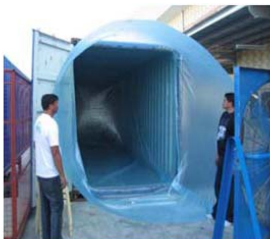
Figure 5. TranSafeliner™ being installed in a standard shipping container, 2008.

moisture contents generate modified atmospheres due to the respiration of the microflora and the commodity itself. Data were compiled for insect control and for quality preservation of stored cocoa beans by employing a novel approach through the use of bio-generated modified atmospheres as a methyl bromide alternative. The respiration rates of fermented cocoa beans at equilibrium relative humidities of 73% at 26°C in hermetically sealed containers depleted the oxygen concentration to <0.3% and increased the carbon dioxide concentration to 23% within 5.5 days. This hermetically sealed flexible structure contained 6.7 tonnes of cocoa beans at moisture content of 7.3%. It was monitored for oxygen concentration and quality parameters of the beans (Fig. 6). No insects survived the oxygen