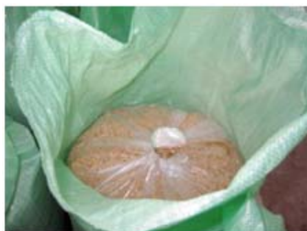
Figure 3. Hermetically sealed SuperGrainbag™ with corn seeds inside a woven polypropylene bag.

is a 3-layer coextruded plastic with thickness of 0.078 mm, 3 \text{ cc m}^{-2} \text{ day}^{-1} permeability levels for oxygen and for water vapour of 8 \text{ g m}^{-2} \text{ day}^{-1} . These features of SGB maintain commodity quality, even with long transport times and in humid environments.