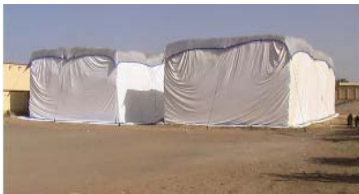
Figure 2. 1050 Tonne MegaCocoon™, Sudan, 2009.