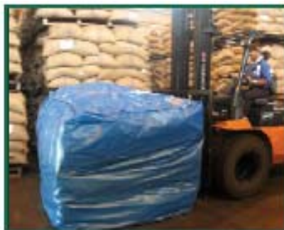
Figure 8. Cocoa in SuperGrainbag-HC, 1 tonne, Singapore, 2009.

produced results equivalent to storing under air conditioned conditions or refrigerated storage for periods of up to a year. Later, IRRI showed safe storage in the smaller SuperGrainbags (60 kg) (Rickman and Aquino, 2004; Villers and Gummert, 2009). Other studies on hermetic storage of rice and corn seed in Mexico, Thailand, Bangladesh, and Cambodia showed similar results for periods of 90-280 days with germination rates at the end of the period from 95 to 98.3%. SuperGrainbags are now used on a large scale by Bayer CropSciences for rice seed storage in the Philippines, India, Indonesia and Brazil.