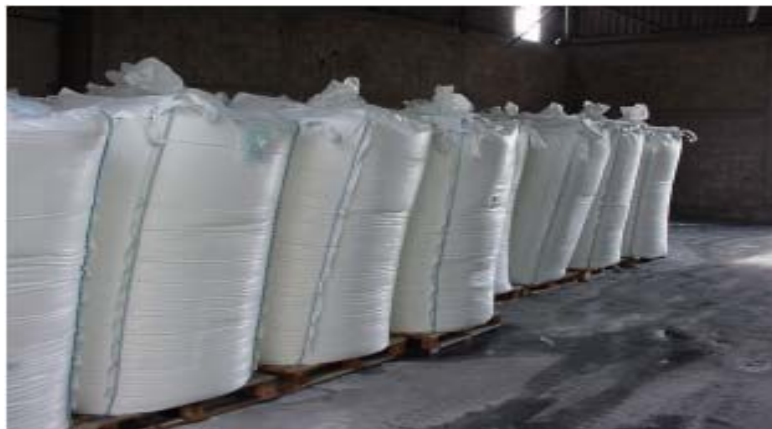
Figure 4. One tonne SuperGrainbags-HC™ storing paddy with woven inside protective polypropylene bag.